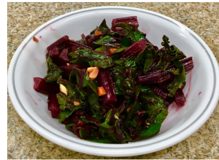
Sautéed beet greens with peanuts

For information on how to obtain some of the produce on campus or to get recipes, contact landgrant@uttc.edu .